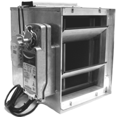
AD-1250 Airflow Measuring Station

All AD-1250 Airflow Measuring Stations are built to order and cannot be returned due to ordering errors. Airflow measuring stations are backed by a 1-year warranty, which covers defects in materials or workmanship. Refer to terms and conditions of sale for specifics.